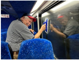
Deepwood Industries staff actively networks throughout Lake County

Deepwood Industries and Laketran...a great match!!